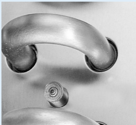
The proven floating coil design: For additional condenser stability and a longer life

coil design. Reliable, low-maintenance operation with little noise generation is also provided in the external areas of the Metro distribution centres.