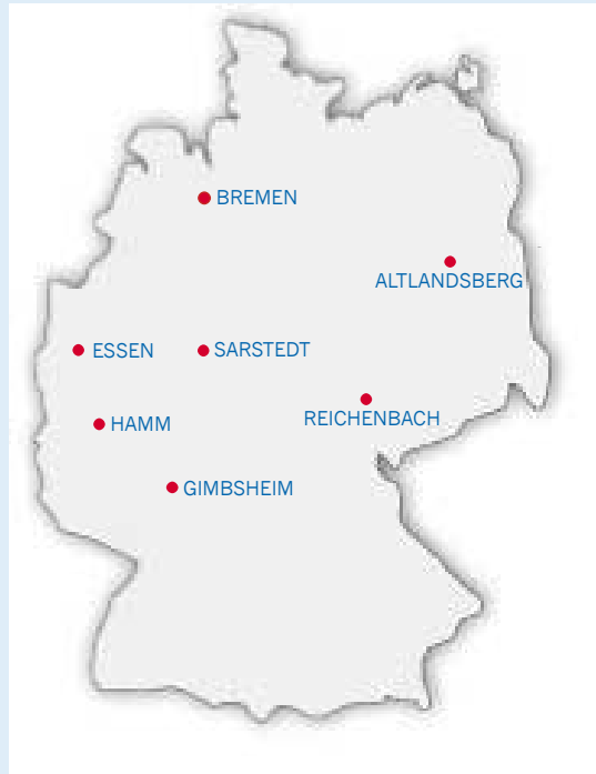
The seven German distribution centres: Perfectly designed refrigeration systems provide freshness and product quality.

The globally successful METRO company has extremely high standards for maintaining freshness and product quality in food logistics. As an operator of central warehouses for deep-frozen goods, dry and fresh produce, fruit, vegetables and non-food articles, METRO distribution logistics is responsible for looking after the quality of about 21,000 different articles and the delivery thereof to 850 markets. The standards that the company demands of the warehouses in its seven distribution centres throughout Germany are accordingly high: incoming and outgoing goods must be reliably processed without any loss of quality, and refrigeration and deep-freeze storage systems must be efficient and easy to maintain.